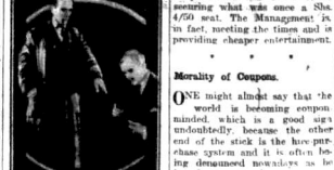
THE SLEEPING CARDINAL. Victor McLaglen, Film Star, Producer, Director, and Actor.

national secret service agent, requires Marlene Dietrich at least constant change of character throughout the story's action. Presented first as the bitter and discouraged woman of the Vienna salons, she emerges as the master of Vienna's dressing rooms and clubs. Again her appearance changes and she is seen as a French peasant woman, a girl and boy before the general staff.