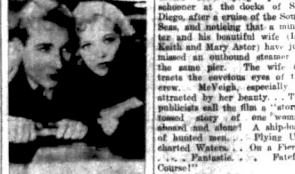
HEAVENLY CREATION MARLENE DIETRICH IN "FIVE AND TEN"

EXCEPT for its rather weak ending, most people enjoy "Morocco" perhaps, if no more, because of Marlene Dietrich herself, who rivals "The Garden." "Disboured" promises well, for, besides the