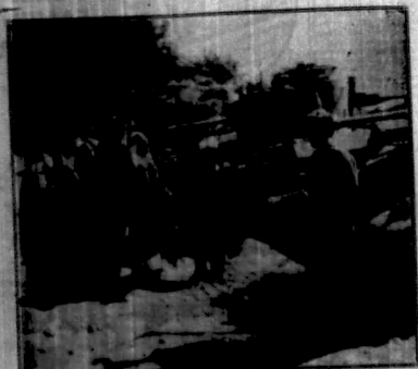
H.R.H. El Amir Mansour, 6th son of King Ibn Saud of Saudi Arabia, inspecting light tanks in the Middle East.