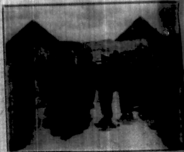
H.R.H. Emir Mansour inspects Indian troops in their camp near Cairo.