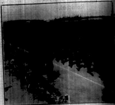
King George of the Hellenes watches Greek troops march past somewhere in Palestine.