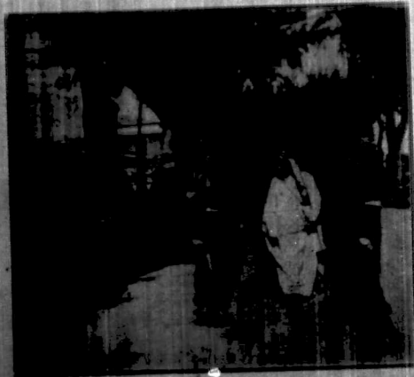
The Emir accepts the Guard of Honour of his arrival at Suez.