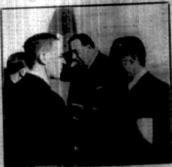
Sir Stafford Cripps conversing with Sir Walter Monckton, on an airfield in the Middle East when on his way to New Delhi.