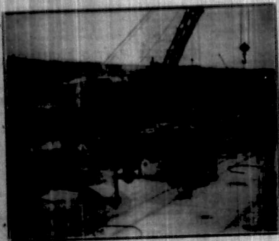
American loaves arriving in crates at a port in the Middle East, being assembled on the spot.