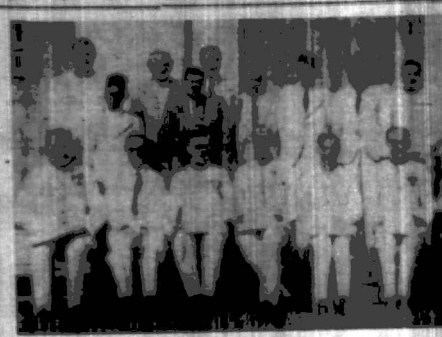
An official group photo of the members of the new Executive Council of the United Kingdom...