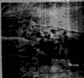
Two hikers, sitting on the log bank, looked up the water cave over an arid hillside.