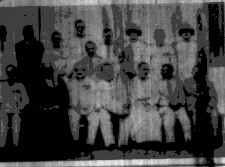
The members of the Legislative Council of Tanganyika, including the Prime Minister and other officials.