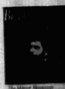
The Master Musician