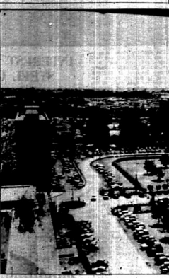
This victory of the city square... (Caption text is partially obscured and difficult to read fully.)

THE United Nations stood at the bar of world opinion and would be judged by the rest of the world in action in settling the Middle East problem. This British Government view was discussed in a debate in the House of Commons. Opening the debate, the Foreign Secretary, Mr. Selwyn Lloyd, pointed out that the United Nations had been put into the position that its prestige would be vitally affected if it did not procure at least an easing of the situation. "Amid Government cheers, he said: "We think the test is, if those who brought such pressure to bear on us and France and Israel will face up to the fact of the situation and undertake a proper share of responsibility for securing a solution." For the Socialists, Mr. Aneurin Bevan spoke of Israel's "act of courageous faith" in leaving Gaza and gave a warning on the consequences if those who persuaded Mr. Bevan to take that course of action, in the face of wide opposition among the Israelis, left him in the lurch. Both sides of the House cheered him when he said: "I believe that he fails, however, to take the steps to preserve peace in the Middle East merely by substituting his patronage for ours."