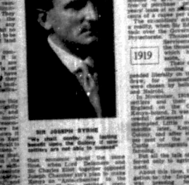
SIR CHARLES EASTON

PLANS to people the 'limitless spaces' of East Africa have engaged the attention of politicians—and farmers. PROMISES have been made but few have been kept. Wars and 'power politics', high prices and bad crops are blamed for the 'sad failure' of settlement.