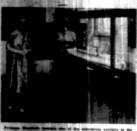
Exhibitors at the Nairobi exhibition in the West Hall...