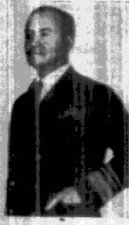
Admiral Sherman

ADMIRAL ROBERT T. SHERMAN, United States Chief of Naval Operations, died suddenly in Naples on Sunday afternoon. He was 61. He was a hero of World War I and had served in the United States Navy for 35 years.