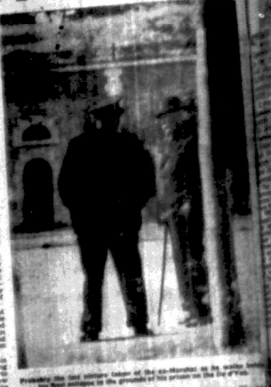
Marshal Petain, once a hero of France who spent the last years of his life in national disgrace on the desolate Iles d'Yeu, died there yesterday.