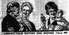
GRANNY TOLD MOTHER AND MOTHER TOLD ME

Wash your delicate garments with "COPRIL" "THE WASHING POWDER MOST WORN NOW USE" Obtainable FROM YOUR GROCER