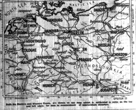
Both the Eastern and Western Fronts are shown on our map which is calibrated in miles on the top and left edges.

A British armoured column has captured the town of Myittha.