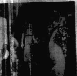
Left: H.H. the Aga Khan leaving the Kikuyu Museum... Right: The Aga Khan (in red) leaving the museum...