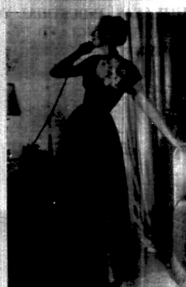
A real outfit made in almost right quantity in the evening. This outfit suits every man with a good command of the...