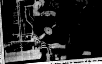
The Minister for Commerce and Industry, Dr. K. N. Kioko, with members of the East African States.

Open daily from 7 am. until 5 pm. Saturday 6 am. - 1.30 p.m. W. E. TILLEY LTD. HARDINGE STREET, PO. BOX 1218