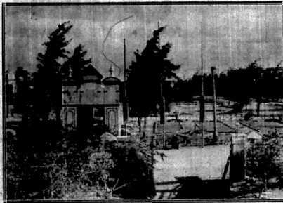
Untidy Kismayu—the Fascist centre of the town.