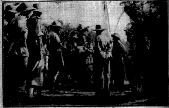
The Italian delegation from Harrar conferring with British officers.