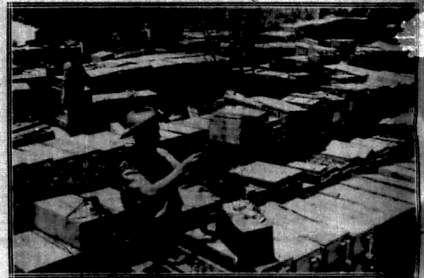
A large dump of Italian ammunition captured at Kismayu.