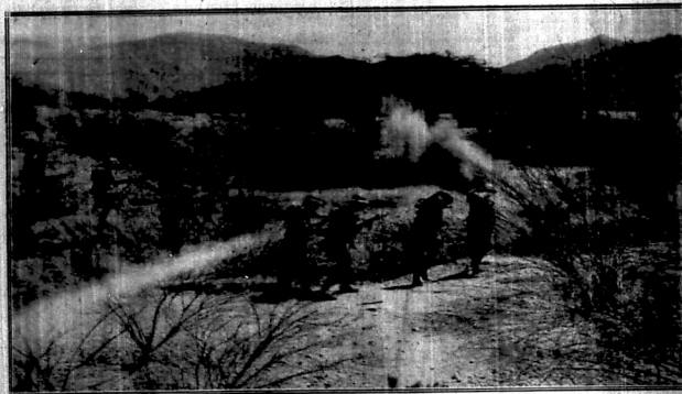
British troops attached to an Indian Brigade in Eritrea advancing with fixed bayonets.