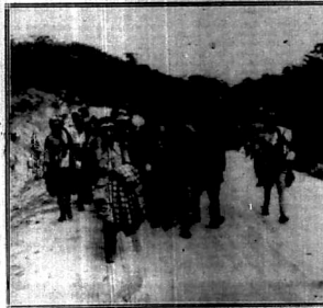
Italian prisoners arriving at British lines outside Harrar.