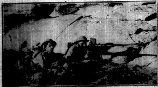
Punjabi soldiers with anti-tank gun in a position on a hill-top.