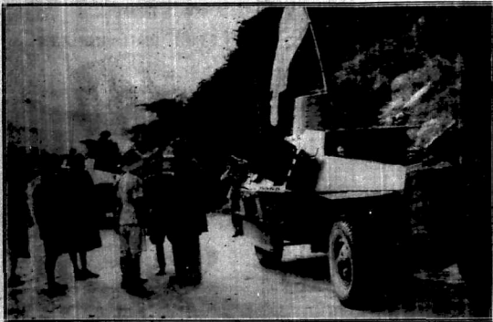
Armoured car bearing the white flag waiting to take Italian officers back to Harrar after having arranged for its surrender.