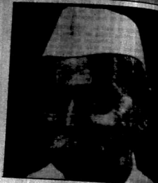
DR. RAJENDRA PRASAD, the first President of the Indian Republic.

Branch Office: 2 Wilson Road P.O. Box 218 KAMPALA