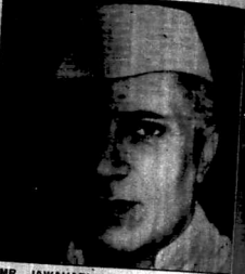
MR. JAWAHARLAL NEHRU, the first Prime Minister of India.