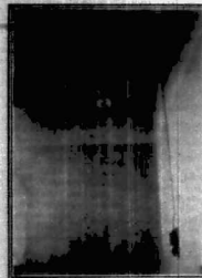
An unusual place for a bird's nest at Magadi.