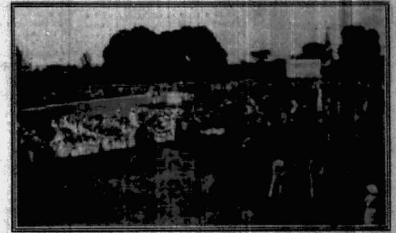
The large gathering of children of all races on Empire Day at Mombasa.