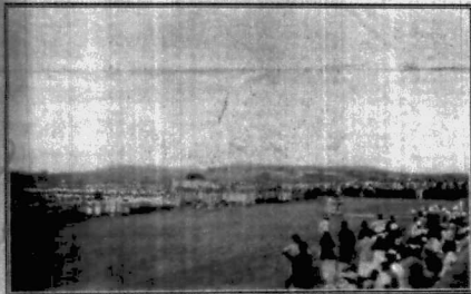
The Governor of Uganda addressing the large gathering at Kampala on Jubilee Day.