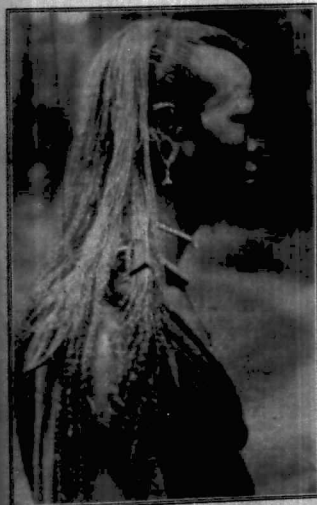
Mami Warrior. The long hair of the man is in strange contrast to the shaven head of the woman.