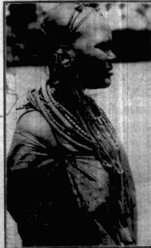
Mami woman.