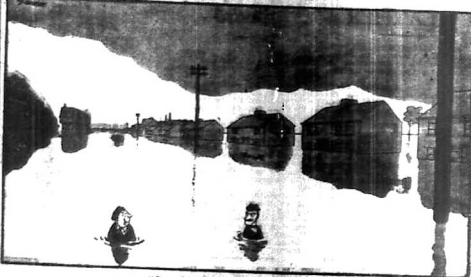
"I'm on a bit—what are you on?"