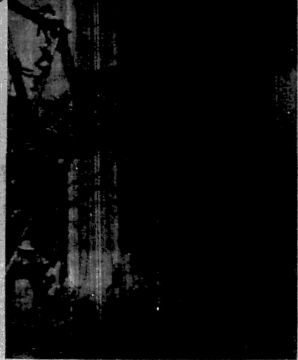
Below—Steel bridge ready for use. The two new spans measure 100 feet long and weigh 70 tons each. They are supported by eight steel trusses, one reinforced concrete shaft. The Orderly (B.C.M.C.) Sergeant of the Battalion (middle) is a graduate of one span which normally goes through during jacking. The Engineer was a member of the Battalion. The man on the right is the man who was on the bridge when the Japanese captured it for the old Burma Railway.

Imagine then two or three Africans poised at all angles in mid-air as if supported by hooks under a machine similar in make, size and weight to a pneumatic road drill chipping the head of a rivet, their bodies shaking