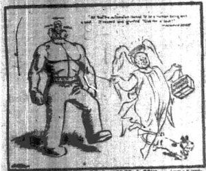
THE GOVT THAT NEEDED A SOUL

It is not a question of the future of the land. It is a question of the future of the people who live on the land.