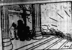
THE DEFENSE OF ROME (Copyright in All Countries)