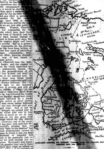
FINLAND—INSURE THE Karelian Isthmus... ON Army tanks and... The State have snatched up men...