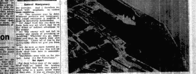
This picture, taken last year, during an Allied bombing attack shows the total ruin of La Havre.

General De Gaulle said that the Allies are attacking the Cherbourg peninsula and that they have developed a heavy presence on the coast between La Havre and Cherbourg.