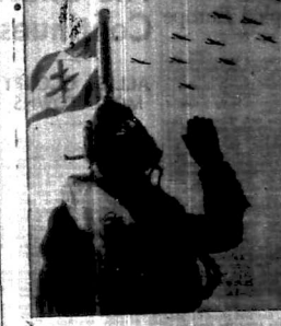
A number of a recently formed French fighter squadron were at the airport at Nairobi, Kenya, to play their part in the liberation of their country...