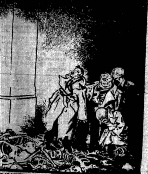
"THIS IS WHERE WE GAVE IN..."

The African Mercantile Co., Ltd. (Incorporated in England) The Kenya Farmers' Association (Co-ops) Ltd. At all their East African Branches.