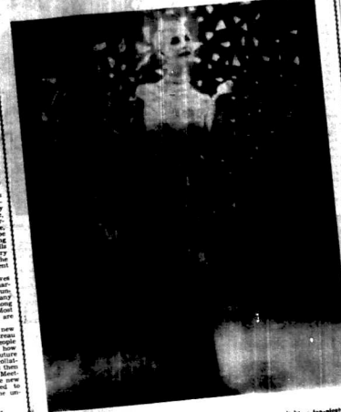
THEY delight most in the post-war... This is a long-planned... that caught us just before the wedding.