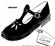
Look for this label— your guarantee of satisfaction

young feet grow in health and strength in Clarks SANDALS