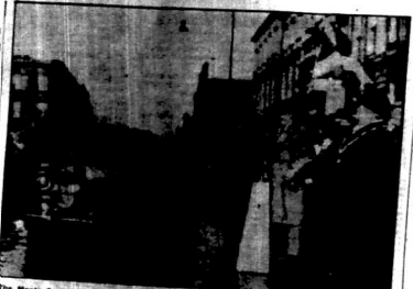
The Scottish League fixtures for today are as follows: Aberdeen vs Dundee, Heart of Midlothian vs Dundee, and Clyde vs Dundee.

The weekend fixtures for the Scottish League will be a busy one. There are several important matches to be played.