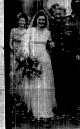
The bride and groom leaving St. Luke's Church, Kiambu, after their marriage on April 21.

You may not know any pain if you're NERVOUS, WORN-OUT, RUN-DOWN, LOSING WEIGHT, but it may warn of worse to come!