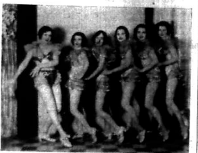
CHORUS FROM "THE NINE O'CLOCK REVUE"

Laughs From The Cinema "Ten Minute Alibi" Next Year Japanese Ball On Friday