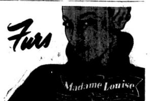
THE FURBER IN MANSION HOUSE. See DM 241, York St. Mansions, Floor 27/8