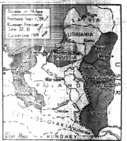
Our map shows a two distinct shades, the partition of Eastern Europe between Russia and Poland, as agreed at the Potsdam Conference.