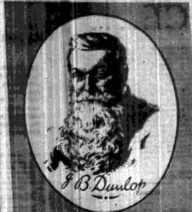
The most famous tyre trade mark in the world