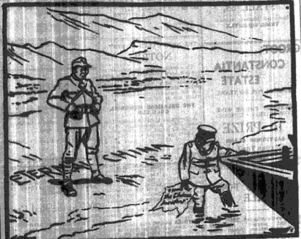
GO AFTER ALL IT PROVED TO BE THE JAPAN INCIDENT...