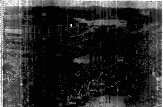
A view of the Parade from the roof of one of the tall buildings in Delamare Avenue.