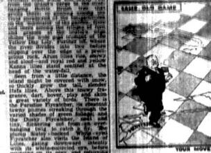
THE DAM AT KARIAKI

It is a clamour of waters... The water is not only a source of life but also a source of power. It is a clamour of waters... The water is not only a source of life but also a source of power. It is a clamour of waters... The water is not only a source of life but also a source of power.