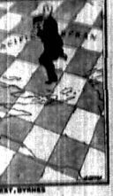
YOUR HOME HERE, VIKINGS

The Board... The Pence-Newton Agricultural Production and Settlement Board is a key organization in the region. It is responsible for the development and management of agricultural production and settlement in the area.