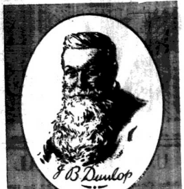
The most reliable Trade Mark

THE GOVERNMENT'S POLICY The Government's policy in regard to the Kenya Loan has been the subject of much discussion in the past few days. It is clear that the Government is not prepared to continue to support the loan, and that the Government is not prepared to continue to support the loan. THE GOVERNMENT'S POLICY The Government's policy in regard to the Kenya Loan has been the subject of much discussion in the past few days. It is clear that the Government is not prepared to continue to support the loan, and that the Government is not prepared to continue to support the loan.