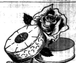
petal soft finish for natural loveliness

No other refrigerator offers all these advantages... Electrolux Silent Refrigerators. Sold Agents for British East Africa. BRITISH EAST AFRICA CORPORATION LIMITED. Sales - and Service offer Sales!