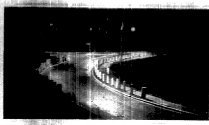
Nairobi experimental lighting

War interlude... The interlude is... It is a brief respite.