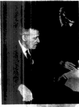
Sir Owen Dixon, Australian jurist, who has been appointed member of the Indo-Pakistan dispute review committee.

Montrose Bay, who was shot at... of the joys and sorrows of teaching