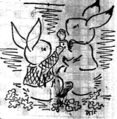
The whole night through and nobody will be disturbed...

"I have had you," said Badger, "and so they are..."