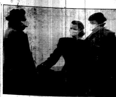
Students training at the Teacher Training College, Nairobi.