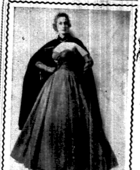
Iridescent Taffeta Evening Gown, with cleverly draped shawl. Gowns are now showing for the approaching Festive Season.

For M. Dior is a great believer in jewelry, especially new quality costume jewelry which is usually just as effective and certainly more in wear than the anxiety that the real thing ever did. He has shown us the real thing, and he has shown us the real thing.