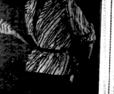
The thin-and-white two-piece design of sheer dress in black motif and beaded lace is printed on steel.

The designers who have taken Dior's new line to heart are few and far between. However, if you search carefully you will find a few here and there, but for the most part, they are still wearing the styles of last year. They are still wearing the styles of last year. They are still wearing the styles of last year.