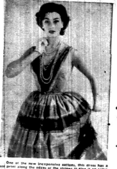
One of the new inexpensive cottons. This dress has a lead print along the edges of the stripes to give it an extra crisp look.