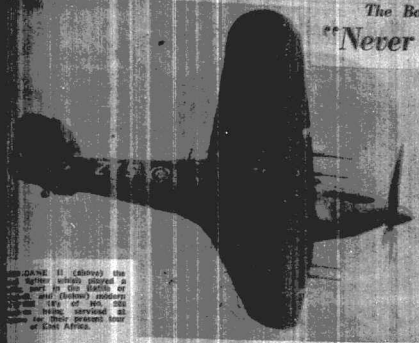
BOEING B-17 (above) the first bomber which scored a hit by the Battle of Britain. (Below) another B-17 which was shot down over the Channel. The B-17 is the only bomber which has served in the West African theatre.