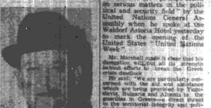
Portrait of a man, likely a political figure mentioned in the text.