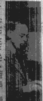
SIR STAFFORD CRIPPS, President of the Board of Trade.

London, Sept. 12.—The British government has announced that it has found more dollar savers in the United States.