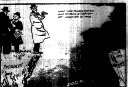
PATH TO RECOVERY