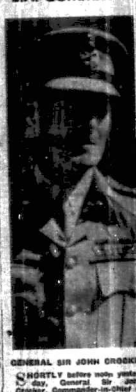
GENERAL SIR JOHN CRONIN is shown with other officers on a tour of the East African Command.