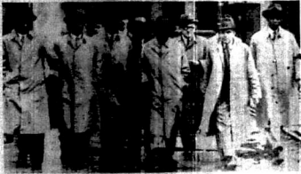
Below: The civilian party from East Africa, suitably clad for the weather, sightseeing at the Lady Winifred Dispensary in South Wales.