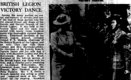
Victory spirit of the Legion.