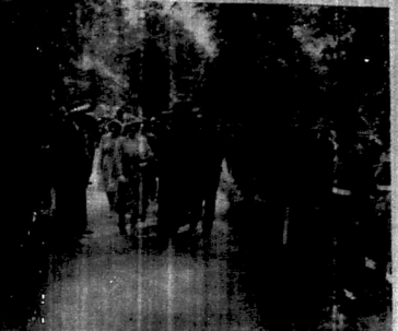
Above: Their Majesties with members of the K.A.B. Band. The bandmen marched on the big parade in full dress and met at eleven. Below: The end of the visit.