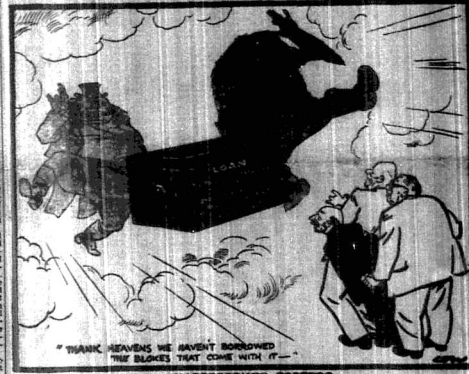
"THANK HEAVENS WE HAVEN'T BORROWED THE BLOKES THAT COME WITH IT" - SHAPPROPRATE PORTERS

Mr. Creoch Jones stated that the Government would be prepared to discuss the terms of the agreement with the East African territories. He said that the Government would be prepared to discuss the terms of the agreement with the East African territories.