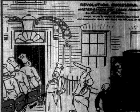
COL. BLIMP'S HISTORY OF ENGLAND

Leakage of draft peace treaties terms BIG FOUR CONSIDERING IMMEDIATE PUBLICATION PROPOSAL