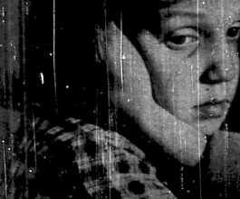
Mr. and Mrs. ...