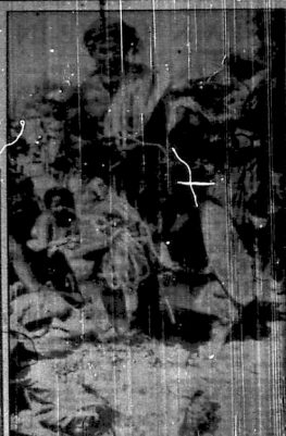
The central market of Taiz, present capital of the Yemen. Earlier its custom in the Yemen, and where money is used, it is the Maria Theresa dollar. Taiz became the capital soon after Ahmed secured power early in 1949, after the assassination of his father, King Yahya.