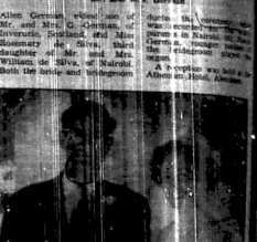
Mr. and Mrs. ...