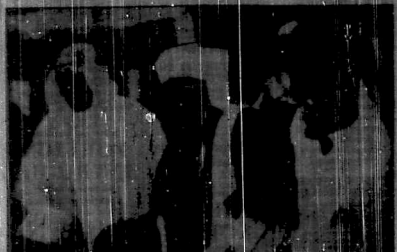
King Ahmed (center), with King Saud of Saudi Arabia on the right, during the latter's visit to Sana'a in 1954. A year later King Ahmed was deposed for a short time by his brother, Abduh, but Ahmad regained power and Abduh and another brother, Ash'ab, were executed below, a wealthy merchant's house near Sana'a, showing the characteristic architecture of the country.