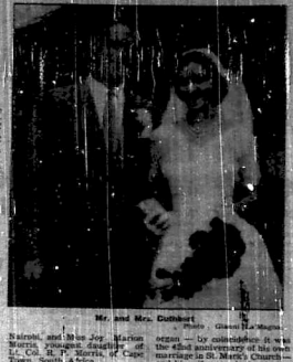
Mr. and Mrs. ...