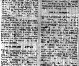
Mr. and Mrs. ...