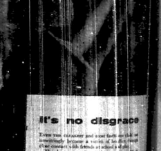
Mr. and Mrs. ...