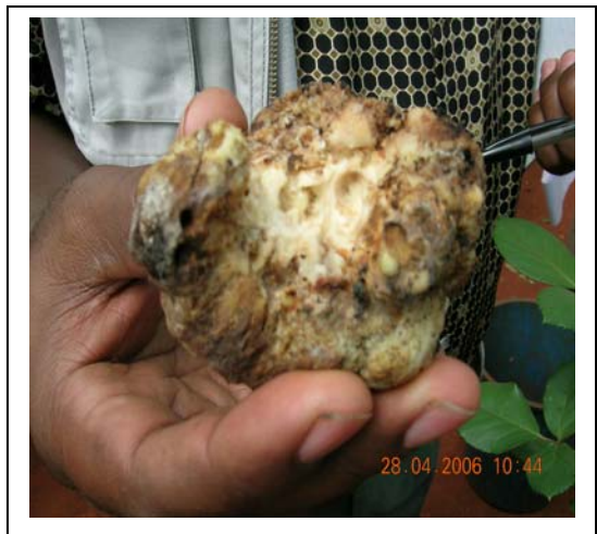
Fig. 1. Rose plants showing crown gall at the crown and on young stems.