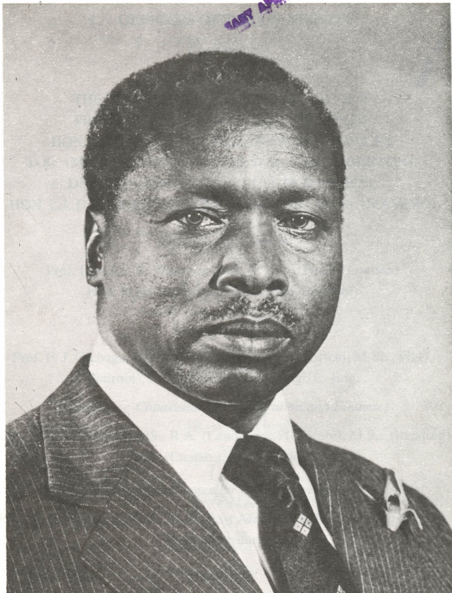
His Excellency the Hon. Daniel T. arap Moi, C.G.H., M.P. Hon. LL.D. (NAIROBI), D.Sc. (NEW BRUNSWICK), D.Sc. (MOI), Ed.D. (KENYATTA), D.Sc. Agric. (EGERTON), D.Sc. Eng. (JOMO KENYATTA), Ph.D. (SOKA), Hon. L.L.D (ANDREWS), D.Ed. (BARATON), D.Litt. (MASENO) Chancellor of the University of Nairobi and President of the Republic of Kenya and Commander-in-Chief of the Armed Forces