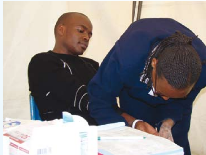
A student undergoing a HIV test during the World AIDS day

ment of neutralizing antibodies in patients infected with HIV for long periods of times but who have not progressed to AIDS. It is thought such these neutralizing antibodies prevent the subjects from developing disease and that information obtained from the antibodies would be useful in designing better HIV vaccines. This study involves other countries such as Uganda, Rwanda, Zambia and South Africa. To date several Kenyans with these neutralizing antibodies have been identified. More studies are being developed to look at these antibodies in greater detail.