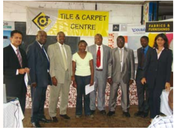
Tile & Carpet management with College of Architecture and Engineering officials after the scholarship presentation ceremony

The selection of students for the award of these scholarships will be based on their final year's academic performance as elaborated in the Tile and Carpet Scholarship Application Forms.