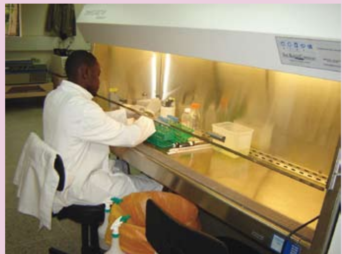
Sections of level 3 laboratory at the UNITID building.