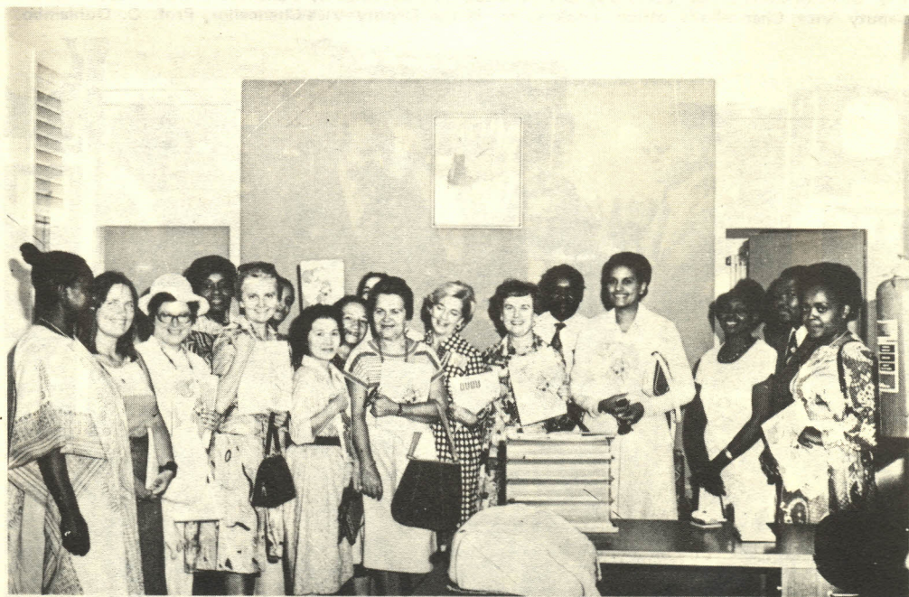
The visiting Ladies made an extensive tour of ICIPE. Here they are seen in a jovial mood as a demonstrator makes an interesting point.