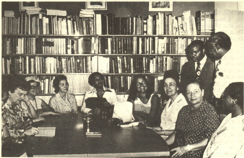
The lady visitors settle down for a discussion inside the library of ICIPE.