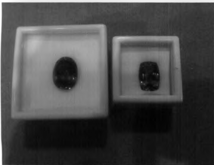
Figure 2: Tavorite Gem Stones Mined at Taita Taveta, Cut and Polished in Germany

Taita Taveta is not only endowed with one of the richest diversities of wild animals in the world but it also boasts resources in minerals and gemstones, including garnet, tourmalines, rubies, red