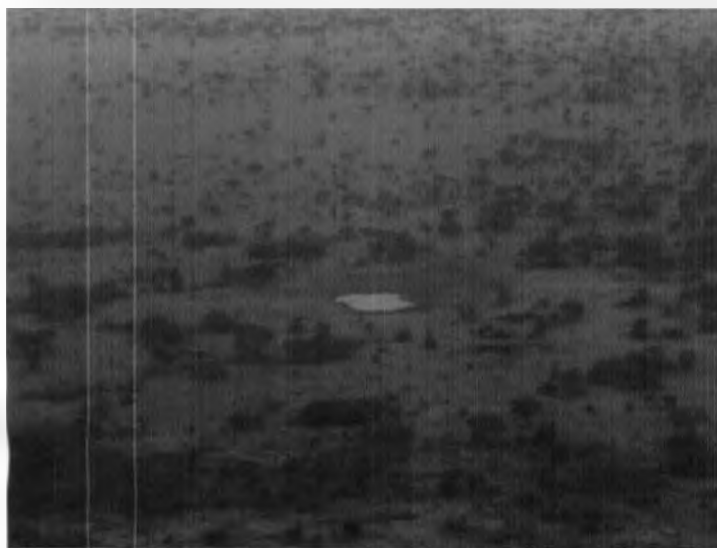
Figure 3: Lumo Animal Sanctuary

According to Mwandawiro Mghanga, the Taita Hills Hotel, the Salt Lick Lodge, the Lumo Animal Sanctuary, the Kenyatta family and several large