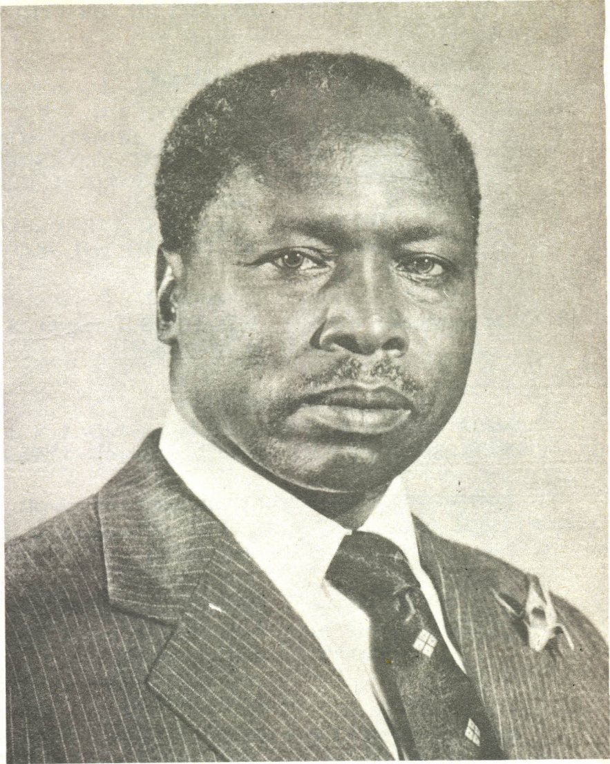
His Excellency the Hon. Daniel T. arap Moi, C.G.H., M.P., HON. LL.D. (NAIROBI), D.Sc. (NEW BRUNSWICK); D.Sc. (MOI), D.Ed. (K.U.), D.Sc Agric. (EGERTON), D.Sc. Eng. (JKUAT) Ph.D. (SOKA) Chancellor of the University of Nairobi and President of the Republic of Kenya and Commander-in-Chief of the Armed Forces