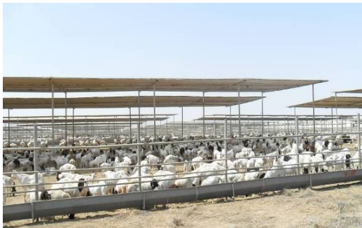
Sheep and goats for export at a quarantine station in Berbera

The University of Nairobi signed a consultancy agreement with FAO to undertake a livestock and meat value chain analysis on live animals, meat and livestock products in Somaliland in March/April 2011. The analysis aimed to understand factors that affect the development of a competitive Somaliland livestock and meat industry as well as identify areas of intervention to foster its development. The project was undertaken by staff from the Faculty of Veterinary Medicine. Data was collected from primary sources through focus group discussions using key informants, stakeholder workshops, observations of livestock marketing infrastructure and activities, slaughter and meat marketing activities, as well as trade in hides and skins. Secondary data was collected through literature search and available reports on various livestock issues. The study found out that Somaliland has organized livestock marketing and trading activities facilitated by organized livestock markets and elaborate quarantine stations that are based at the port of Berbera. However, livestock slaughter and marketing of meat faced a number of challenges that included inadequate infrastructure (Slaughterhouse and associated facilities and equipment), poor hygiene and lack of meat inspectors to carry out quality assurance of meat.