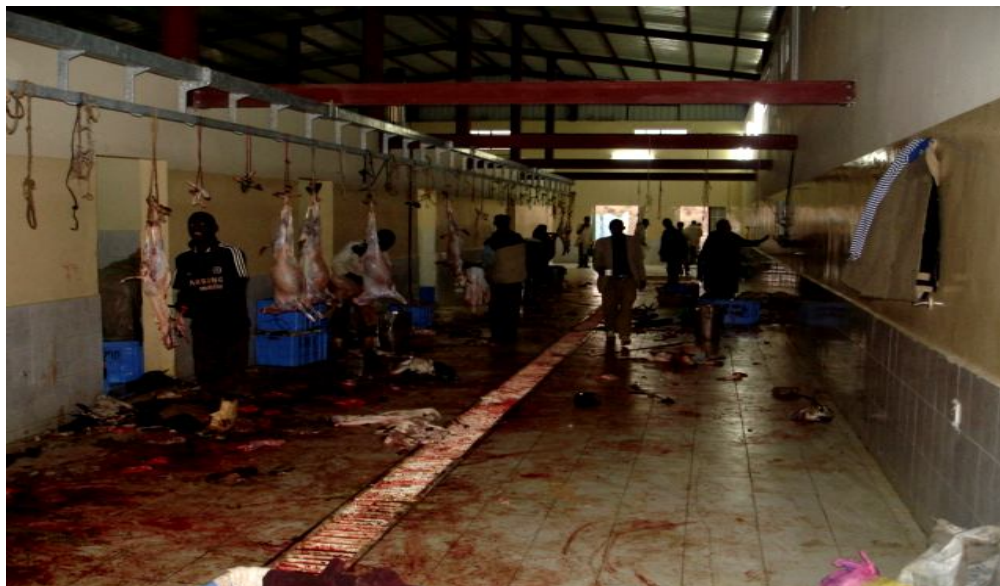
Livestock slaughter has a number of challenges including poor hygiene and lack of meat inspectors