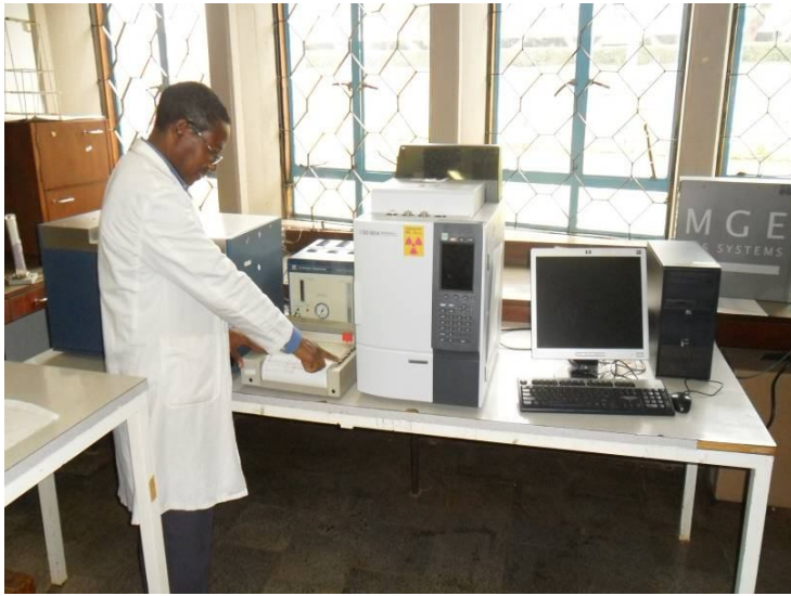
Technologist in the GC room where pesticide residue analysis takes place.