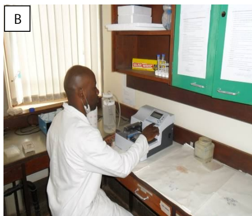
B: Technologist carrying out an ELISA test