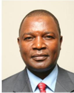
Prof. Njuguna Ndungu Governor, EBS, Central Bank of Kenya