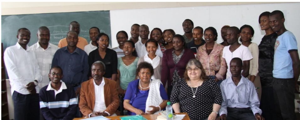
Participants & facilitators of the workshop on writing about personal life experiences!

They added that a good personal story is the one that demonstrates a conflict and how the writer either tried or struggled to overcome it, at the same time evoking emotions from the reader because, as Robert Frost once said, “No tears in the writer, no tears in the reader.” The course was very successful and a publication of the short stories is underway.