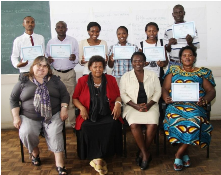
Group photo of the facilitators & participants at the training