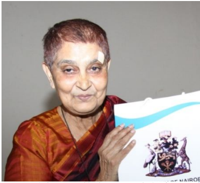
Prof Gayatri Chakravorty Spivak, a University Professor at Columbia University

As scholars, the importance of research in academics cannot be gainsaid. It leads to applications that directly benefit the people of a State and beyond. Without research, we would not be able to transform an unstable nation into a stable nation, shortage into plenty, still into movable. To a large extent, it enables scholars to actively transform our nation and our natural, social and individual worlds for the better.