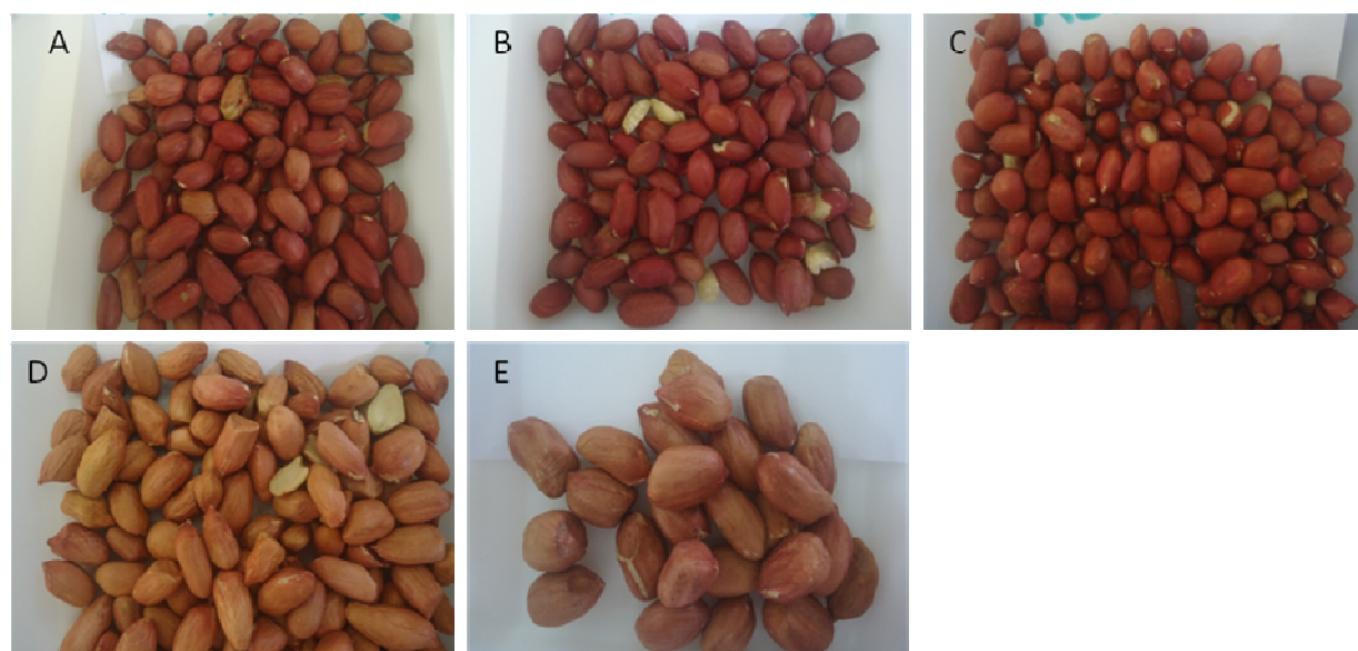
Figure 1: Major groundnut types traded in Nairobi and Nyanza markets in Kenya. (A) Red regular, (B) Red mixed, (C) Red small, (D) Pink regular, (E) Pink large.