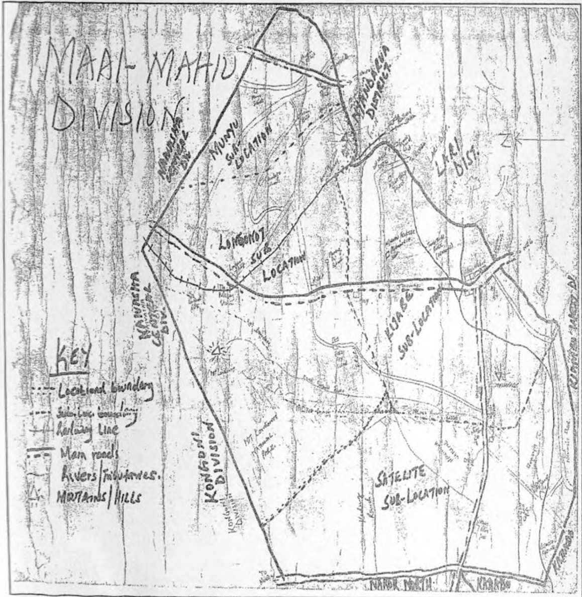
The map of Maai Mahiu Division