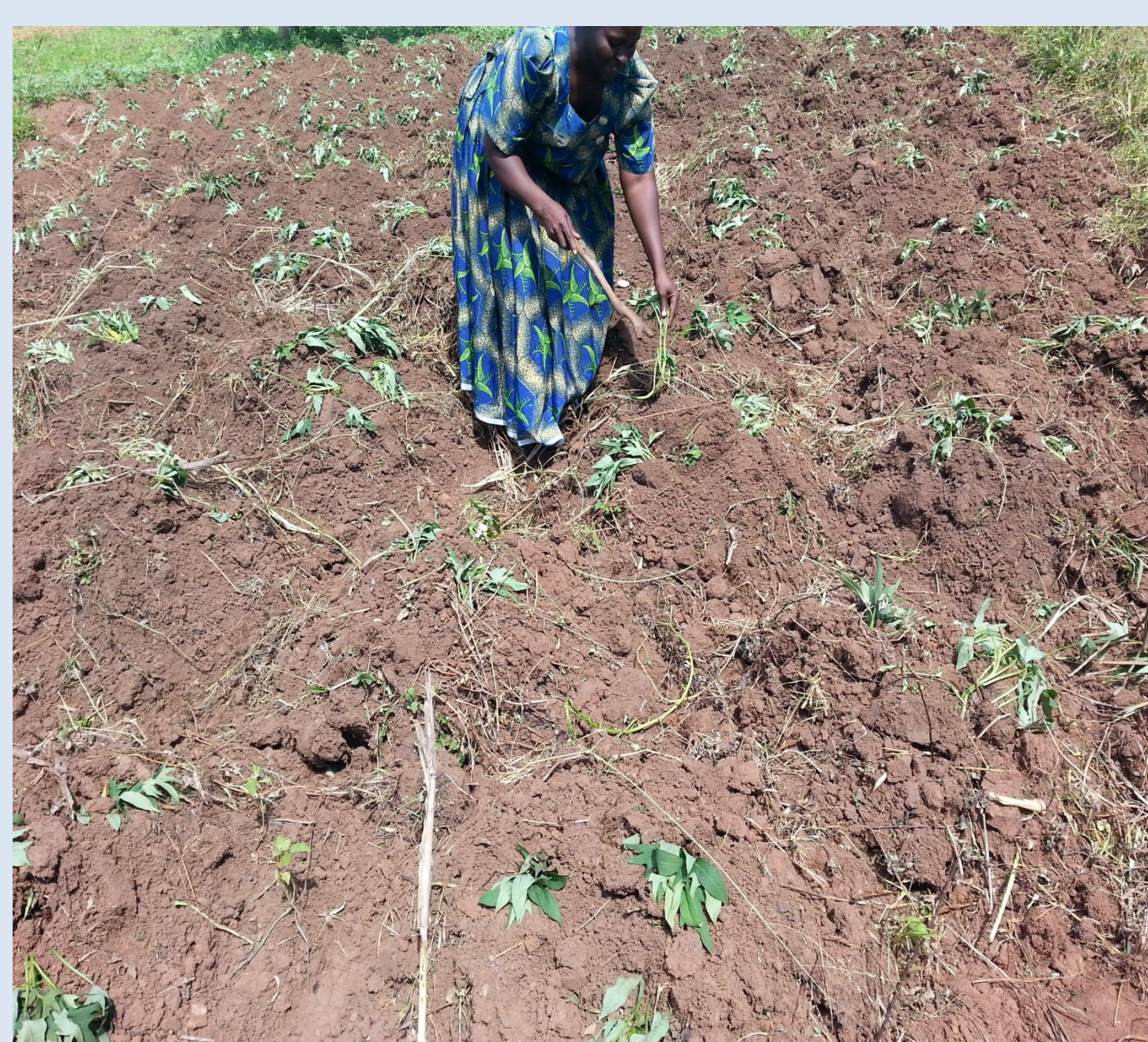
Farmer planting sweetpotato