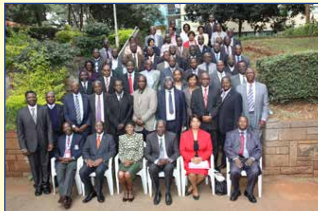
IP sensitization group photo