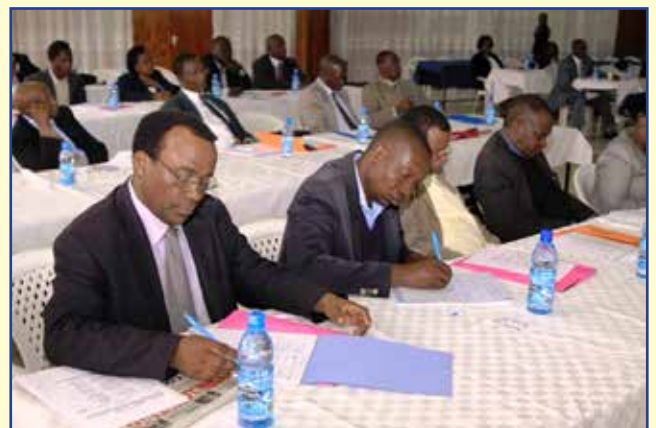
BPS sensitization workshop