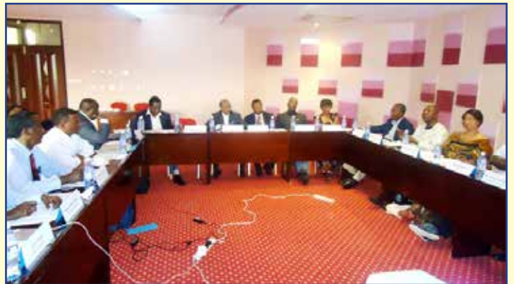
Consultative meeting btwn IGAD, UON ETC4