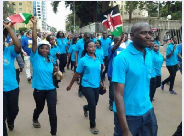
Conference delegates in the social work march in Kampala

The students also got an opportunity to tour the Huye, Murambi and Kigali Memorial Sites of Genocide, which gave them a vivid exposure of the horrors of negative ethnicity permeated through wrong propaganda and the resultant effects on the society. The tour also provided them with a good opportunity to bond and establish a base for comradeship as upcoming social work professionals in East Africa region