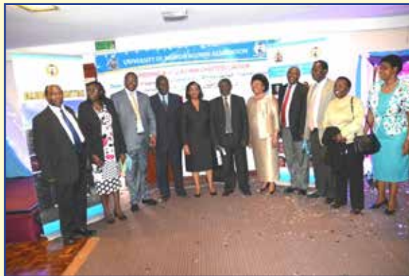
launch of Engineering-ADD Alumni