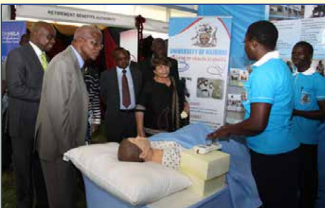
CHS open day