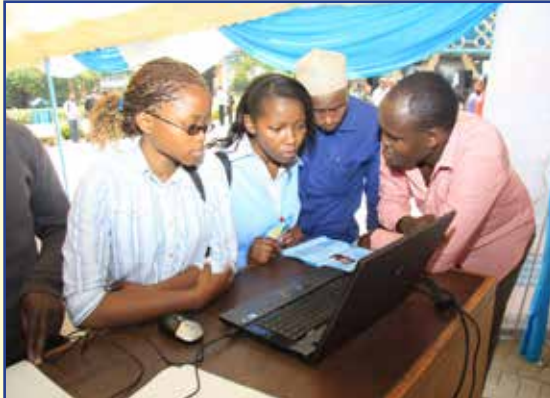
Open access day