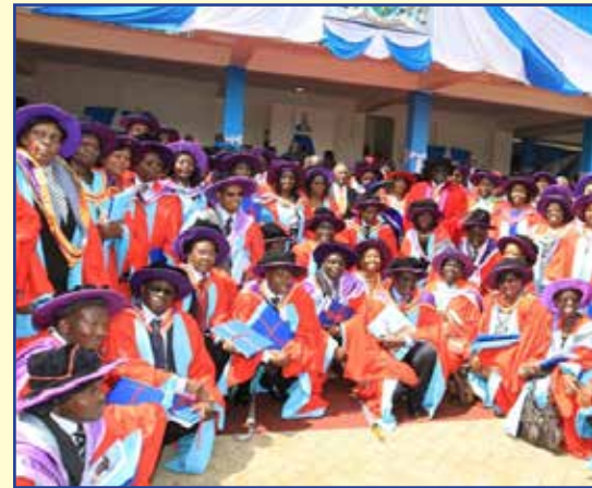
50 th UoN Graduation