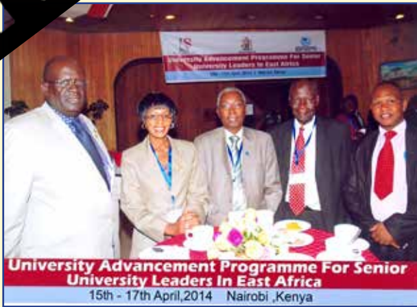
University advancement programme