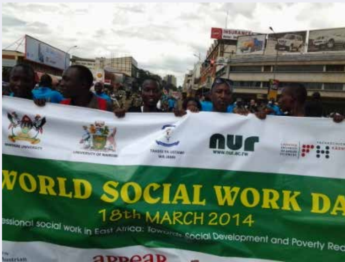
UoN students march to mark the World Social Work Day with other delegates

Most importantly, the UoN students learnt that professional social work in Rwanda was a direct outcome of the 1994 genocide. Prior to that, there was no training for social work in the country and the response to assist both the traumatized victims and perpetrators of the genocide yielded the foundations for professional social work education and practice in Rwanda.