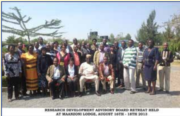
RDAB Maanzoni workshop