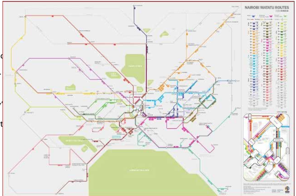
Digital Matatus: Organizing Nairobi Transport System

The digital map can be accessed via: www.digitalmatatus.com