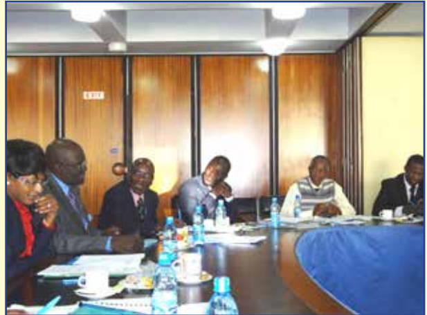
RDAB consultative meeting