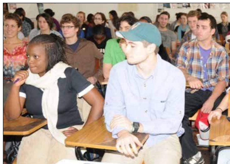
Front row left: A UoN student attending a foreign exchange programme forum.

‘Together with partners, the University of Nairobi strives to educate global citizens for the future and extend the frontiers of knowledge for the benefit of all humanity.’