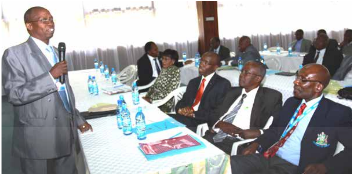
IP Sensitization workshop