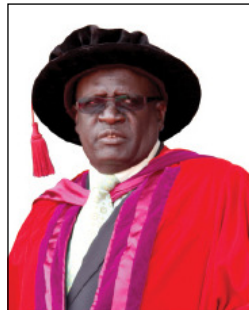
Vice-Chancellor Prof. George A.O. Magoha, EBS., MBBS, (Lagos), FRCS, FWACS, FICS, FCS, (ECSA), MISC, FKNAS, FAAS, FMCS, (Urol)