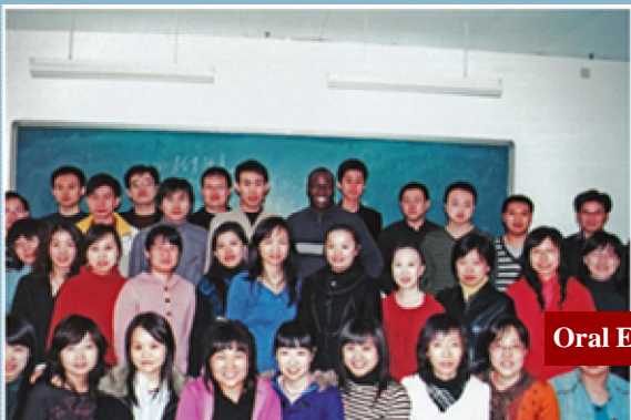
Oral English Class