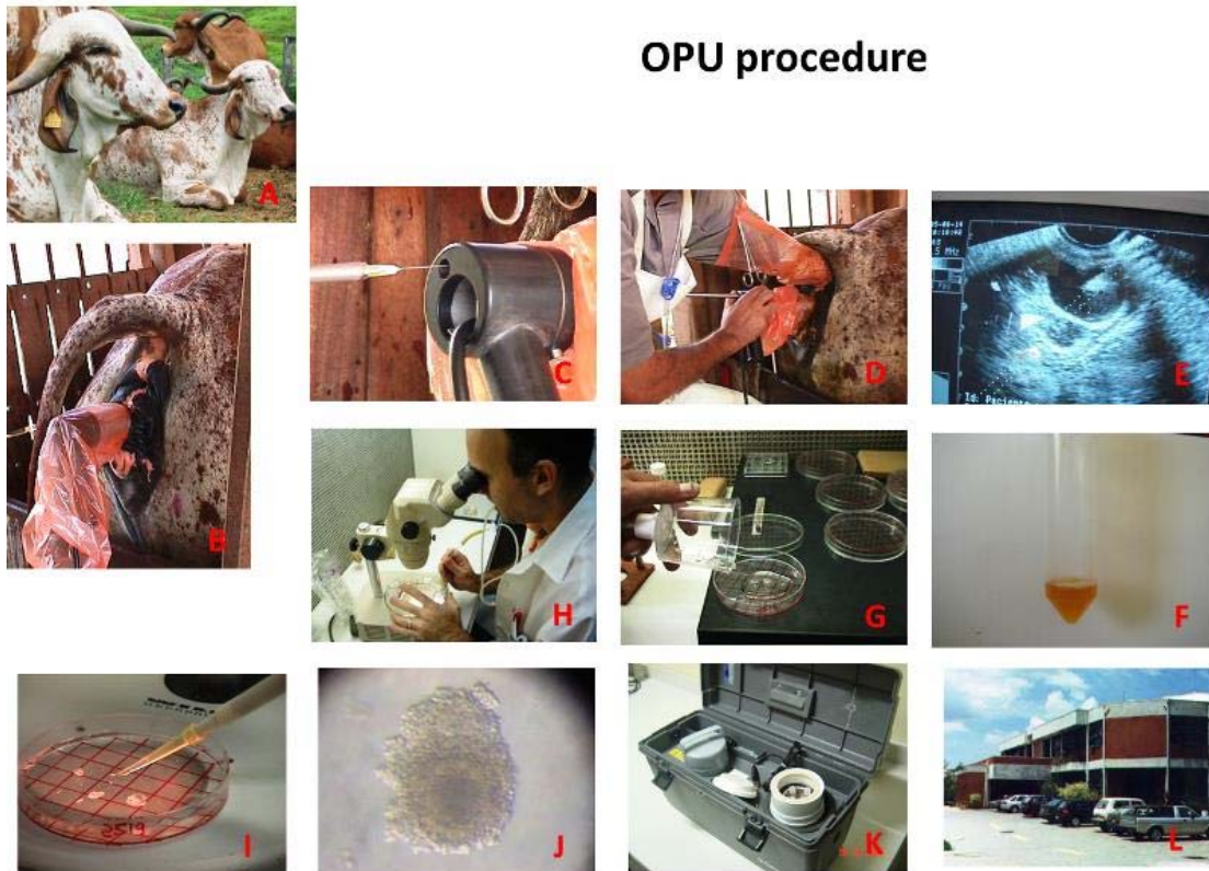
Figure 2: Photographic demonstration of the OPU procedure; donor cows selected (A), then ultrasound device inserted into the vagina (B), needle put into the device (C), the expert picks the ovary towards the intra-vaginal ultrasound device (D), the follicles are viewed through the ultrasound monitor (E), the follicles are aspirated into a tube (F), the follicles are poured into a petri dish (G), the follicles are searched (H), the follicles are recovered into another petri-dish (I), grade A COC (J), grade A COCs are loaded into thermos flask (K), the COCs are delivered to the laboratory (L)

This technique is used for repeated collection of COCs from top grade cows. The method was also used within the IVEP system reported here.