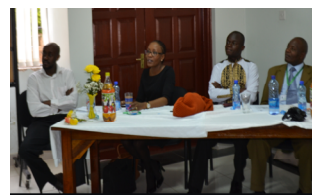
Speakers at the NUBSA Career Fair Day

College of Biological and Physical Sciences (CBPS) also played host to students from Technical University of Kenya, Kenyatta University and Jomo Kenyatta University of Agricultural and Technology. Organizations which played a key role towards the success of the event were Kenya Youth Biochemistry Network and