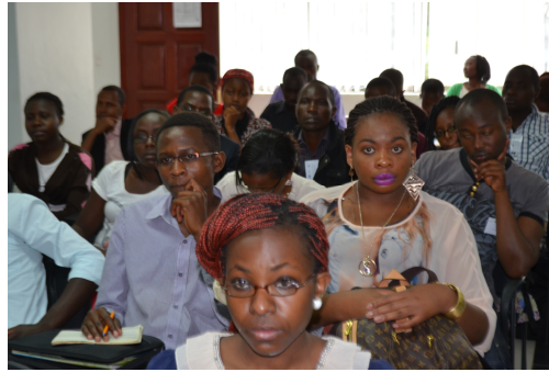
Attentive NUBSA members taking stock of their options

Speakers drawn from the field of Forensic, Bioinformatics, Manufacturing and Engineering, took students through career opportunities in Bioinformatics, building Curriculum