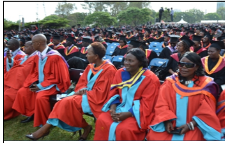
Graduands at the 2014 graduation ceremony

At least 950 have graduated from the College of Biological and Physical Sciences in the year 2014. The College also registered the highest number of PhD grandaunts during the August 2014 graduation, where 8 out of 19 grandaunts were conferred with Doctor of Philosophy degrees.