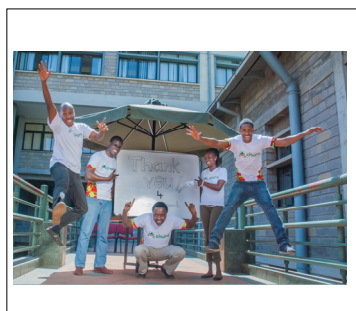
Chura makes a Great Leap Forward

tor the startups to come up with a working business model for six months, beginning November 2014. The best three out of the five startups, will be invited to London to be awarded the African Prize for engineering innovation.