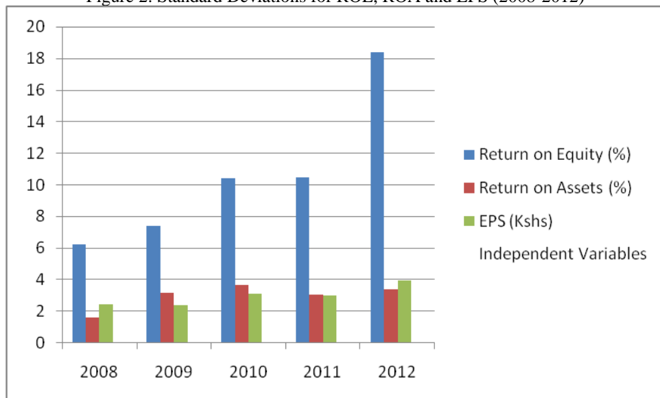
Figure 2: Standard Deviations for ROE, ROA and EPS (2008-2012)